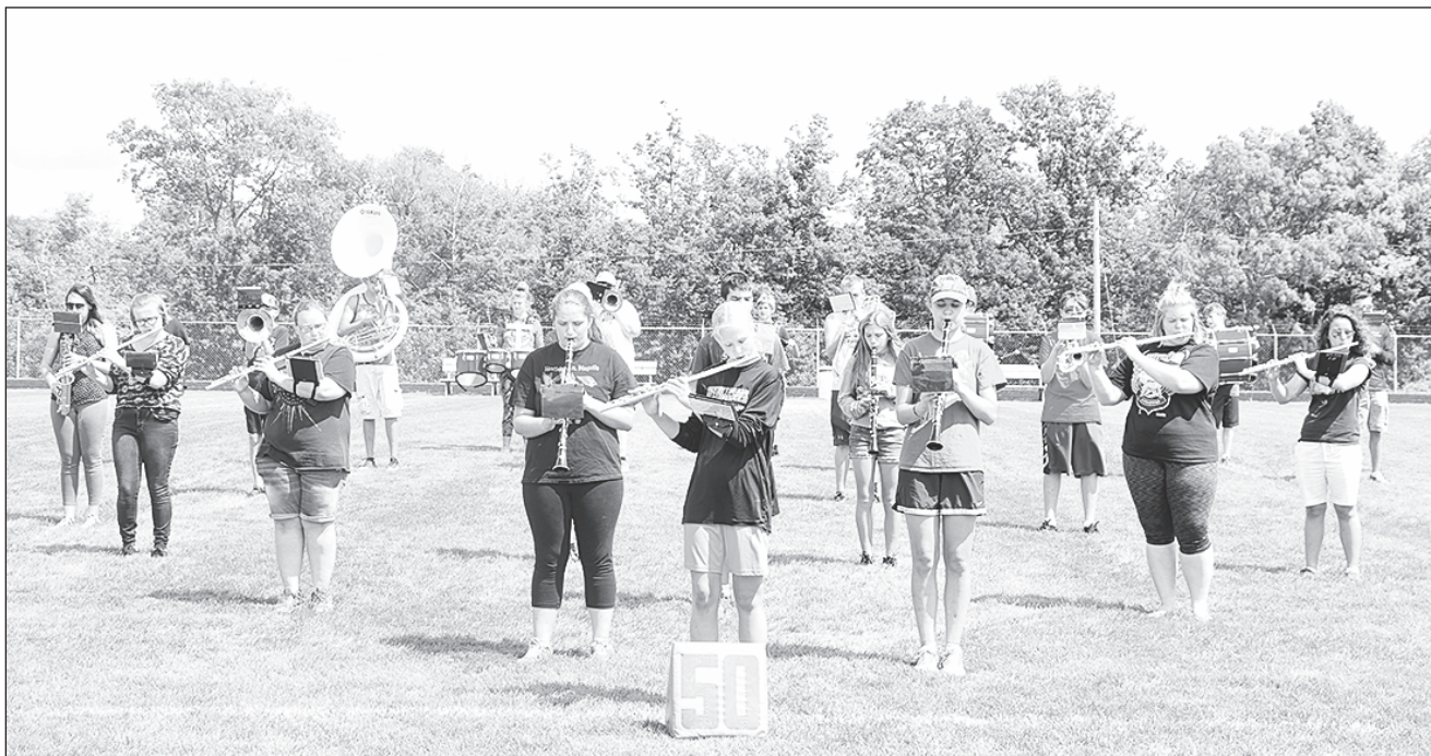
The Mayville High School marching band attended the annual week-long band camp to learn routines and rehearse for upcoming performances. The band is seen here in formation on the football field.